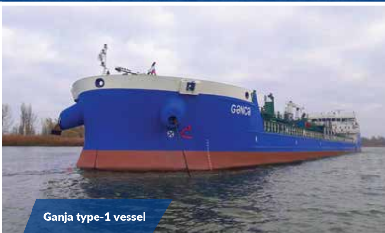
Ganja type-1 vessel