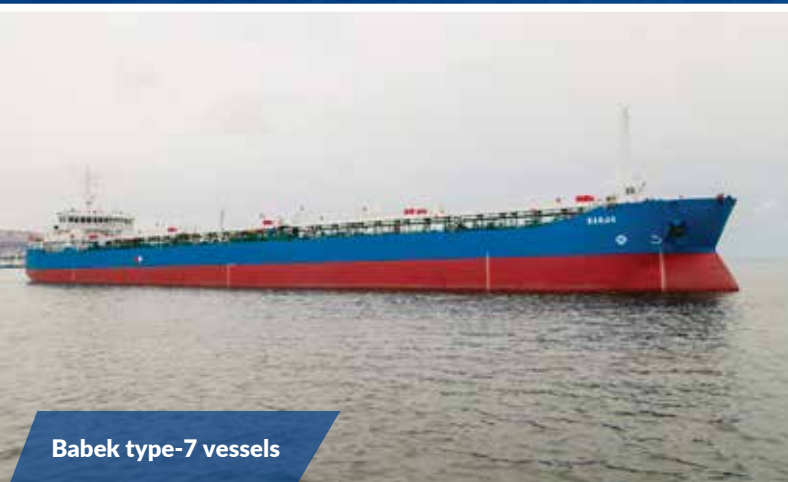
Babek type-7 vessels