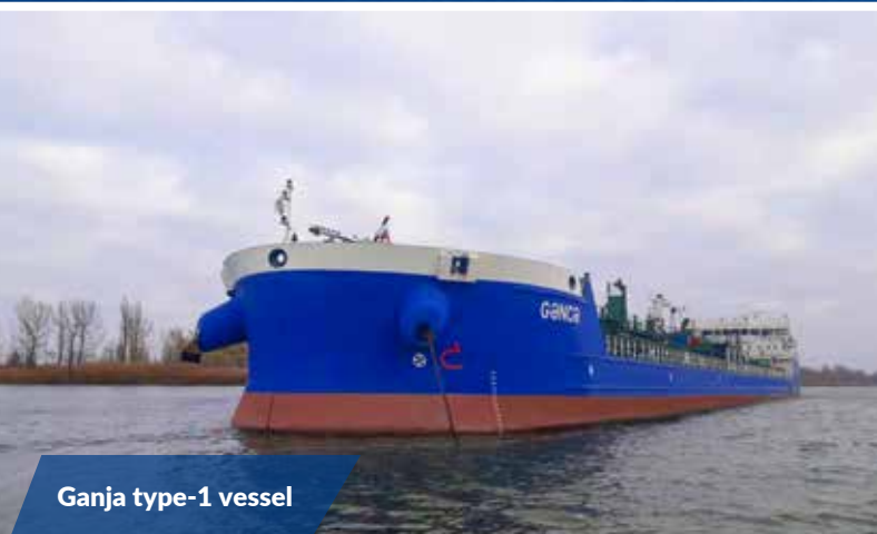
Ganja type-1 vessel