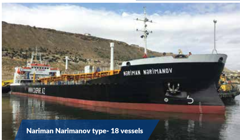
Nariman Narimanov type- 18 vessels