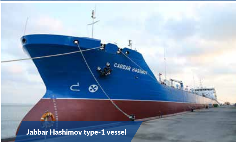
Jabbar Hashimov type-1 vessel